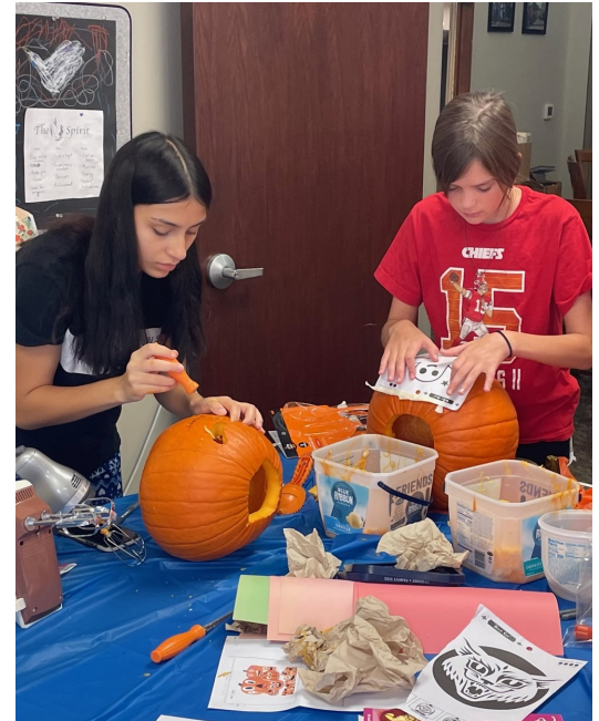
Photos: The youth had a great time carving and decorating pumpkins on Sunday, October 22.