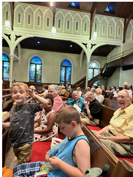
Photo: A joyful moment during a Sunday worship service in August.